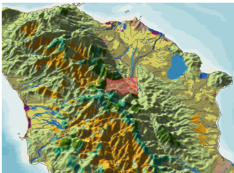
Figure 3: Topographical map showing river systems and location of the Mindoro Nickel Project on a watershed

A range of environmental risks is associated with the process plant and RSF. Nickel metal and cobalt salt, the by-products of ammonium sulphate (fertiliser), metallurgical grade chromite and minor amounts of zinc sulphide will be produced at the processing site. 156 Intex plans to construct a fuel/oil depot, a storage area for chemicals and reagents, a power station, hydrometallurgical process facilities, workshops, an administration building, a warehouse, personnel housing, a mess hall, a laboratory and heavy equipment shops. 157 Potential risks include reduced water or water quality, air pollution, accidental waste discharge, and traffic accidents. Health hazards include noise/dust pollution and the spread of transmittable diseases due to the large workforce. 158 Stored chemicals for processing and possibly also stored residue may contain heavy metals and contaminants such as sulphuric acid, 159 and after processing sulphur dioxide and sulphate. 160 The RSF must be regularly monitored “to avoid