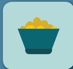
ARTISANAL AND SMALL-SCALE MINERS