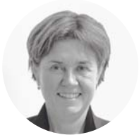
Inger Wiig Appeal Court Judge